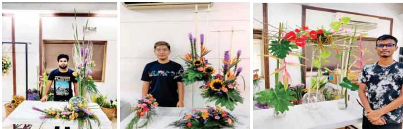
WorldSkills India - International Training

Agriculture SSC's two Skills Floristry and Landscape Gardening were part of National Competition wherein States like Odisha, Andaman & Nicobar, Punjab, Chandigarh, Kerala, Tamil Nadu, New Delhi, Mizoram, Bihar and Maharashtra have participated. In Floristry, 9 candidates had participated and 12 candidates in Landscape Gardening.