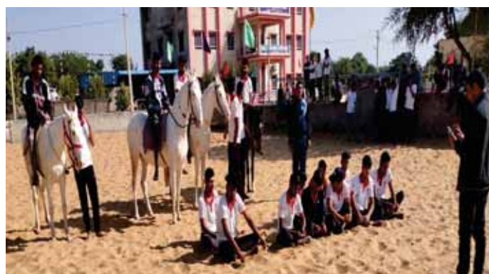
Training for Horse Trainers under RSLDC

Equine Management is one of the important aspects of the Disease and Health management of Equines. ASCI and Rajasthan Skill And Livelihoods Development Corporation (RSLDC) have collaborated for the assessment and certification of Horse Trainers in various districts of Rajasthan and around 400 candidates have been assessed and certified so far. ASCI also planned to place the certified candidates abroad as successful horse trainers.