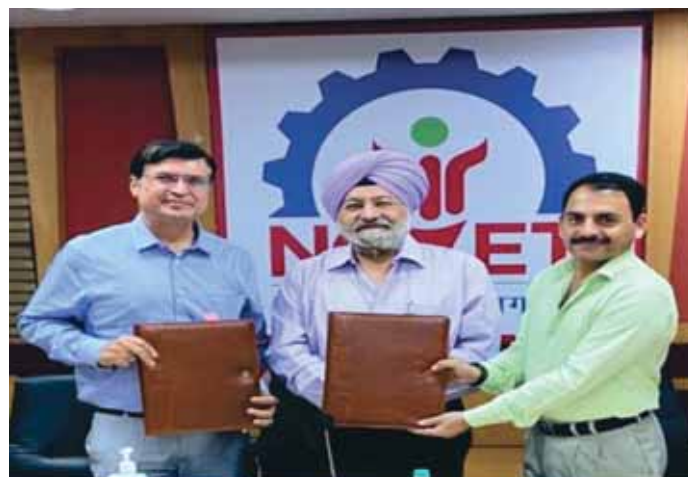
ASCI received the Recognition of Awarding Body

ASCI has been recognized as an “Awarding Body” by the National Council of Vocational Education & Training (NCVET) following the agreement signed on 14 th June 2021 in the presence of the Chairman, NCVET. As an Awarding Body, ASCI would continue its endeavour more strongly to build up robust skill competence in various spheres of agriculture.