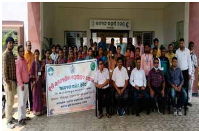
Meeting with Department of Agriculture & Farmers' Empowerment, Govt. of Odisha