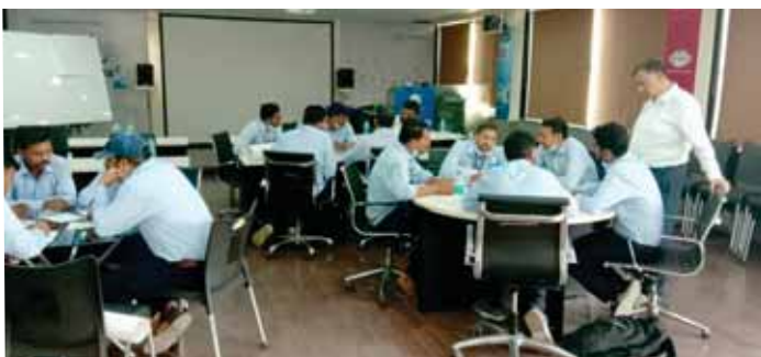
Corporate Training Program for the Prabhat Dairy