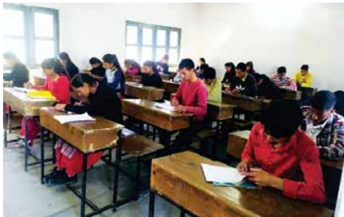
School Program in Himachal Pradesh

The courses covered are from various segments such as Livestock Production and Management, Farm mechanization, Sustainable Agriculture, Green House Management, Fisheries & Aquaculture, Soil Sciences, Organic Farming, Sericulture, Tea Plantation, etc.