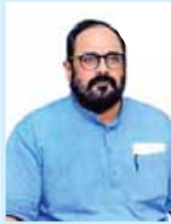
Shri Dharmendra Pradhan Hon'ble Minister, Ministry of Skill Development & Entrepreneurship (MSDE)

“Skill India is one of the most inspiring missions. It remains a very active, well-funded, and solidly supported program of the Govt of India. Skilling should be a collaborative effort between Government & industry that requires skilled talent.