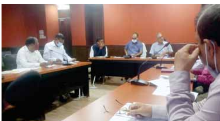
Meeting with Agriculture Promotion and Investment Corporation Odisha Limited (APICOL)