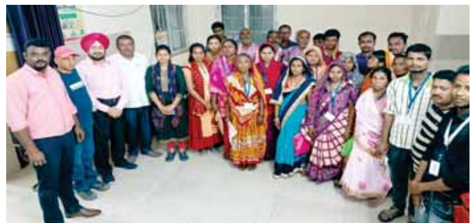
FPO Skill Development Program organised in Madhepura, Bihar