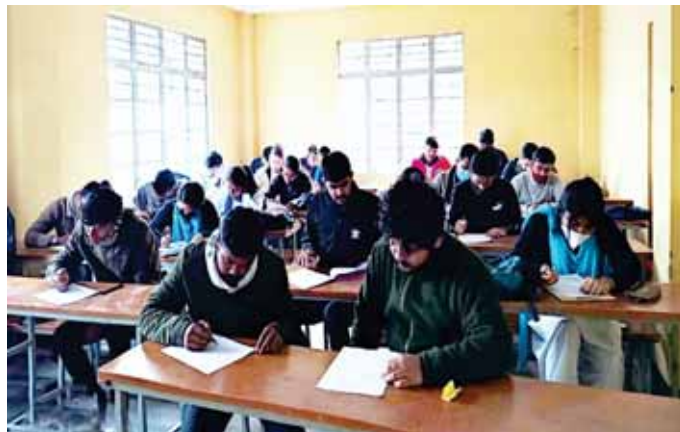
UGC Program in Maharashtra