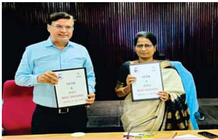
Signing of MoU between ASCI & NFDB

Agriculture Skill Council of India (ASCI) & National Fisheries Development Board (NFDB) signed an MoU on 21 st June 2022. Basis the MoU, the fisheries-related Skill development, Training and Capacity Building programs will be taken up on PAN India basis on need and priority in potential areas for a period of 03 years from the date of signing the MoU. The MoU has been signed in the presence of CEO ASCI and Chief Executive, NFDB along with other officials.