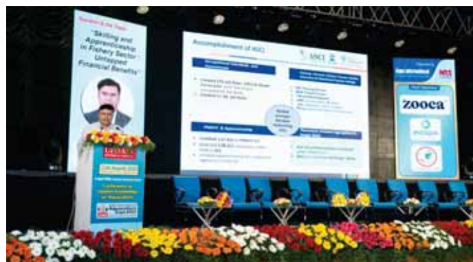
CEO ASCI at the India International Aquaculture Expo (IIAE), 2022

CEO ASCI talked about “Skilling and Apprenticeship in Fishery Sector: Untapped Potential” at the conference during the India International Aquaculture Expo (IIAE) held in Chennai on 6 th April 2022. During the course, he highlighted the youth engagement in apprenticeships within the aquaculture/fishery sector & the demand for skilled human resources abroad with specific skill set requirements. Many organizations from the aquaculture industry and various stakeholders from the sector have shown their presence as a part of this international-level conference.