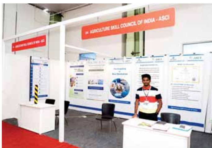
ASCI during India International Aquaculture Expo (IIAE) Exhibition 2022 in Chennai, TN