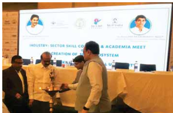
Industry-Sector Skill Council & Academia Meet – Creation of Skill Ecosystem

The Andhra Pradesh State Skill Development Corporation (APSSDC), the Government of Andhra Pradesh has planned an ambitious program to establish Skill Hubs in 175 Assembly Constituencies, one Skill College each in every Parliament Constituency and a global-level state of the art Skill University at State level. The objective was to bring together the Industry-Academia-SSCs to have a synergy in the creation of a strong skill ecosystem customized to the emerging industry requirements and market demands. ASCI along with the other SSCs discussed the Training Methodology & Training of Trainers (ToT) in the skill development ecosystem & the key role that SSCs play in providing the Training of Trainers (ToT) services.