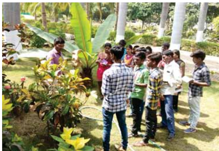
Skill development under MIDH Programme

The Centrally Sponsored Scheme of MIDH which integrates the ongoing schemes of National Horticulture Mission, Horticulture Mission for North East & Himalayan States, National Bamboo Mission, National Horticulture Board, Coconut Development Board and Central Institute for Horticulture, Nagaland also joined the skill ecosystem. In this Quarter, 239 candidates have been trained and certified across the country under Amenity and Production Horticulture. These Horticultural Job roles provided better Entrepreneurship skills while increasing the scope of Wage based employment for the farmers and great enthusiasm was seen among them during the programme.